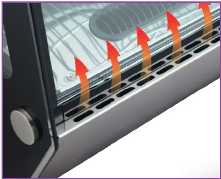
Air duct outside the glass to remove condensation water