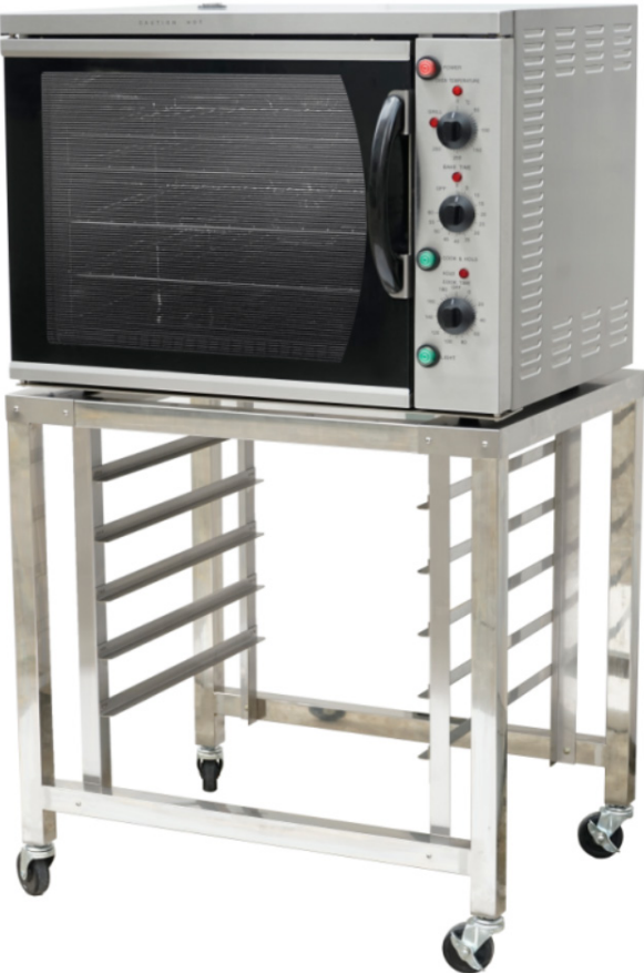
HDSECO-6A (Stand Not Included)